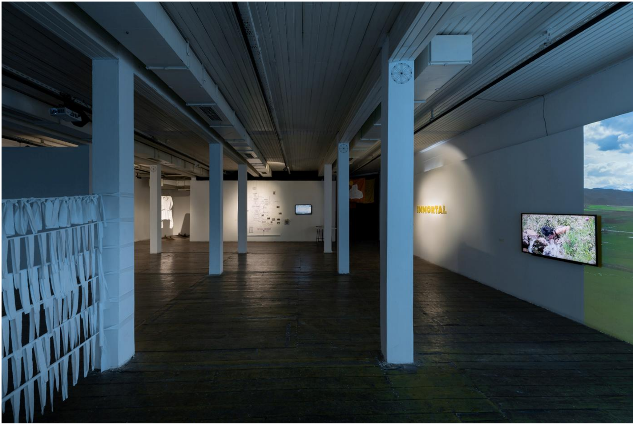
Goat on the Mountain, Moon in the Sky, Fish in the Water solo exhibition view